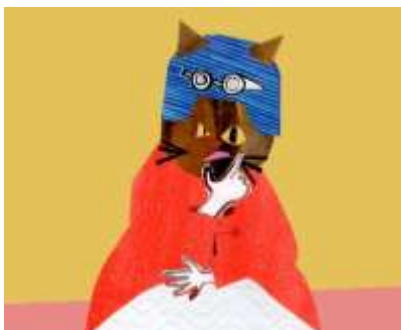
The Anarchist Librarian animated character in the English and Welsh audio versions