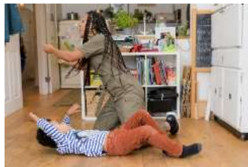
A family play out the adventure together at home!